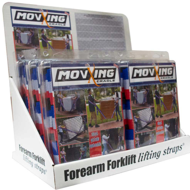
counter-top display (holds up to 6 units)