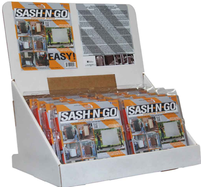
counter-top display (holds up to 8 units) loaded display is item# FFSNGD

Patent / Breveté / Patente No.s: US 7,731,069 GB 2443180 AU 2006241388 MX 289120 CA 2,568,418 DE 20 2007 019 057.3 ES 2332166 Patent Pending / Brevets en Instance / Patente Pendientes: HK, TW, CN, JP & FR